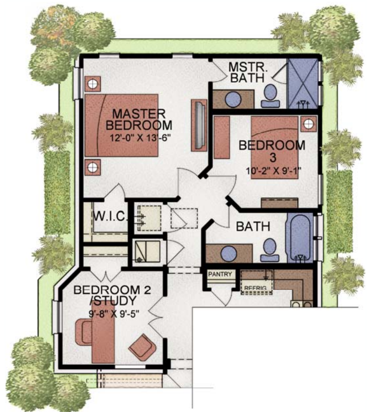
OPT'L BEDROOM 3/BATH 2