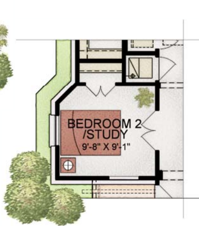
OPT'L BEDROOM 2/STUDY