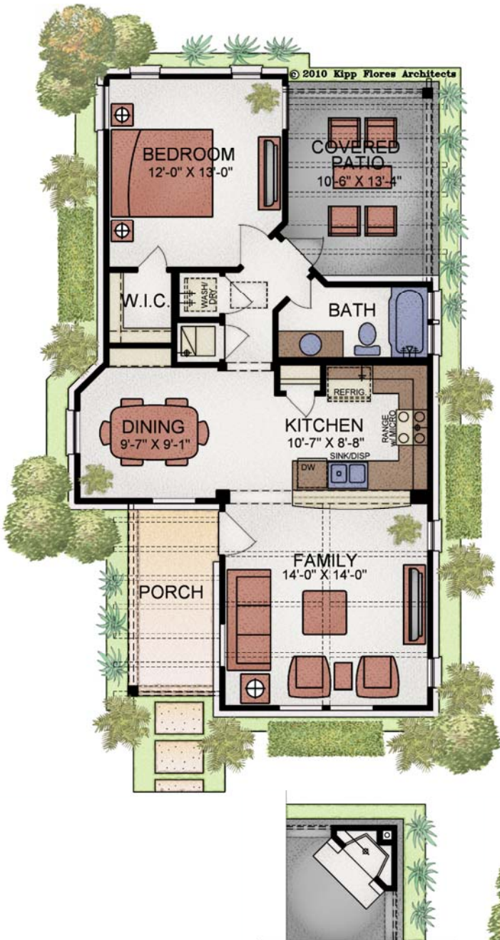
OPT'L FIREPLACE AT COVERED PATIO